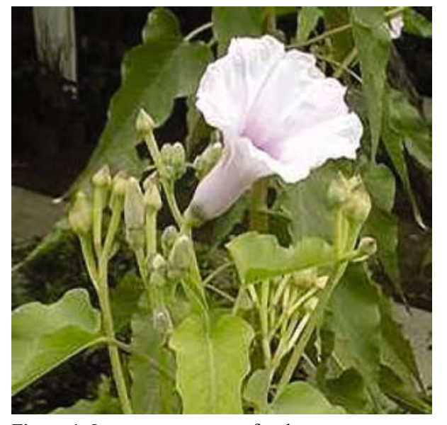
Figure 1. Ipomoea carnea var. fistulosa.

Histopathological evaluation of animals treated with I. carnea revealed the presence of cytoplasmatic vacuolation, mainly in the perikaria of Purkinje cells, located between the granular and molecular layers of the cerebellum (Figure 4). The neurons had swollen, showing loss of cell structure, and eccentric nucleus. Loss of neurons was also observed. Moderate fine cy-