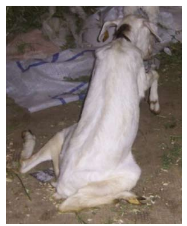
Figure 3. Goat inhability to stand up and conserve the equilibrium.