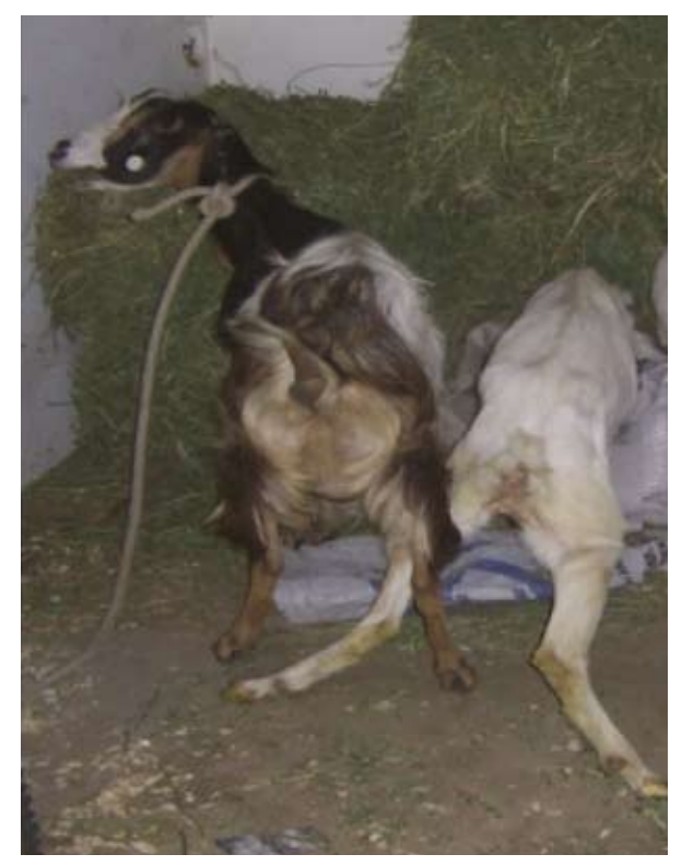
Figure 2. Goat (right) reveals abnormal posture and wide–based stances, due to lpomoea carnea consumption. Goat control (left) shows normal appearance.

toplasmic vacuolation was showed in neurons of the medulla oblongata (Figure 5). Those lesions were observed in all treated animals. The Nills substance was dispersed or absent and the neurons showed chromatolysis in poisoned animals.