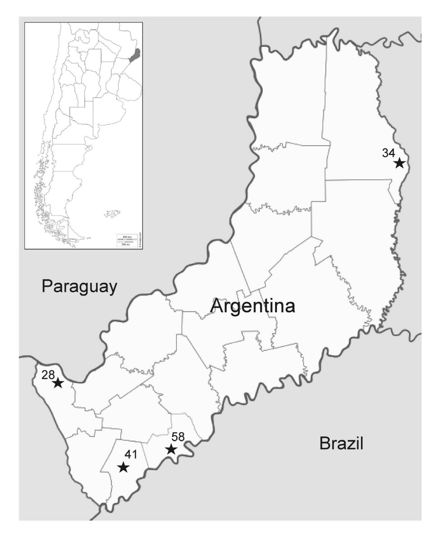
Figure 1. Geographic distribution of the populations of Chrysolaena verbascifolia studied.