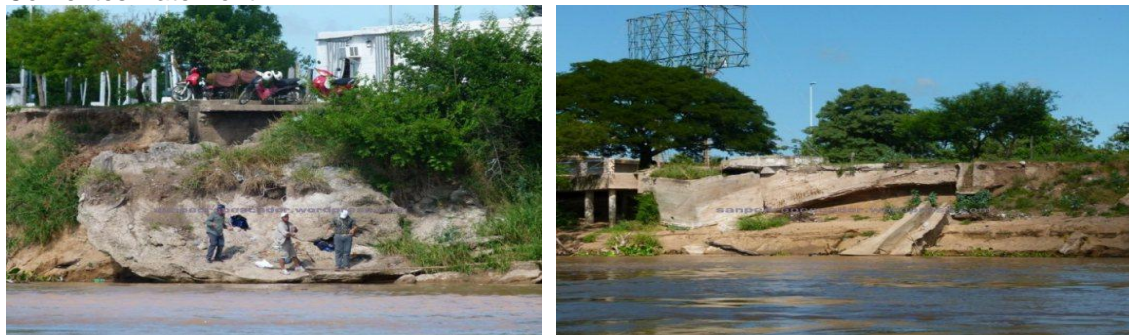
Fig. 5 a), b) Erosion process on the coast of San Pedro.

The number of homes has gone from a hundred in 2002 to about 260 in 2013. The densification and occupation of lots is done in many cases at the expense of public space, as in the case of the occupation of the "neighborhood cancha" (football field) , for housing complexes, generally it also verifies a loss of direct river access pass restricting pedestrian view and the river and Corrientes waterfront.