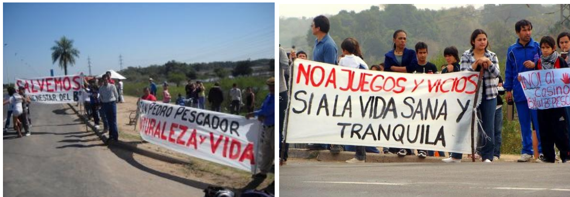
Fig. 7 a), b) Fishermen protesting against the Casino project.

This whole process was marked by the lack of articulation and dialogue between parties involved, who seemed to ignore each other when meeting face to face in the assemblies organized by Loteria Chaqueña, In which villagers claimed to have a more active role and demanded the government to exercise its obligation to reject the imposed project.