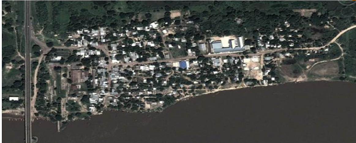
Fig. 4. San Pedro Pescador in 2013

The number of homes has gone from a hundred in 2002 to about 260 in 2013. The densification and occupation of lots is done in many cases at the expense of public space, as in the case of the occupation of the "neighborhood cancha" (football field) , for housing complexes, generally it also verifies a loss of direct river access pass restricting pedestrian view and the river and Corrientes waterfront.