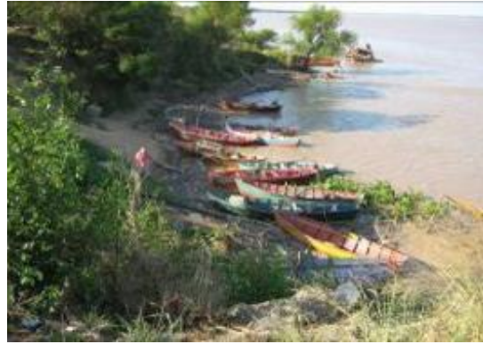
Fig. 2 a), b) Arrival of fishing boats at San Pedro Pescador.

The neighborhood has a privileged location, directly opposite the waterfront of the neighboring city of Corrientes, capital of the province of the same name. Although administratively belonging to the municipality of Colonia Benitez, it has stronger ties with the most populated centers of the Metropolitan region, considering it is 12 km from Resistencia, 6 km from Barranqueras, and only 1,6 km from Corrientes. A large proportion of inhabitants of San Pedro takes advantage of services and facilities from the neighboring Corrientes. This privileged setting means they can offer their products to thousands of potential customers who daily cross the bridge in both directions. But this same situation puts them in a position of vulnerability due to flooding from the Paraná River.