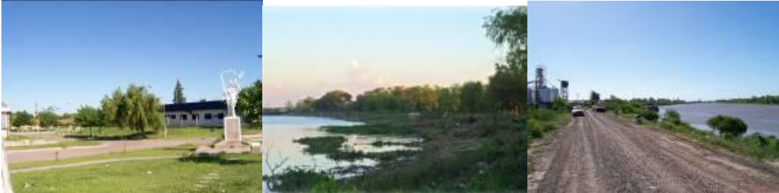
Fig. 9 a) Central Area, b) Riverside fishermen neighborhood c) Defense Port zone

Conditioned by the lack developable non flooding land for housing, the central district is a small area of a few blocks with very low density. The proximity to the capital Resistecia turned in the seventies Vilelas to be consolidated as "bedroom" town with the proliferation of social housing neighborhoods (FONAVI) promoted by the state. In most cases lacking services and infrastructure and located in flood prone areas. The nature of port and coastal city makes Vilelas attractive to the settlement of of some industries generally subjected to the vicissitudes of economic policy and the vulnerability by cyclical flooding. In recent decades urban sprawl was accelerated fueled by informal occupations lacking infrastructure and basic urban services.