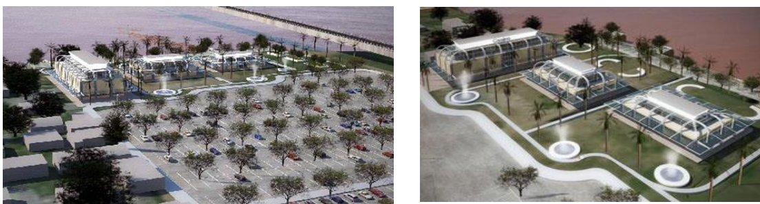
Fig. 6 a) Antequerita Casino Complex: parking area, b) Aerial view of gambling premises.

Territorial conflicts in San Pedro: The nature of Territory is dynamic and complex, being the result of a multiplicity of different actors involved. Gradually over time groups take part in opposing sides and conflicts of interest soon arise as that appeared in 2010 with the attempt to impose a big Casino complex promoted by the Provincial Government in the old building site of the Belgrano bridge.