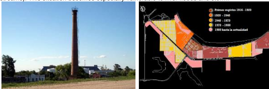
Fig. 8 a) Puerto Vilelas landscape. Former tanning factory chimney that gave rise to the town in 1917, b) Location AMGR.

The AMGR has suffered in recent decades a process of rapid population growth, fueled largely by internal migration. The explosive urban growth is often due as much to the expulsion of rural areas deteriorated, including poverty, landlessness and lack of job opportunities, as pull factors, including better jobs and social services the cities. [UNFPA, 2001]. As physical consequence of this process has been indiscriminately occupying the flat and low resistance natural support, filling and mutilating the delicate system of rivers and lakes in the floodplain of the Black and Parana rivers, which in turn seem further accelerate the dispersion process and urban expansion in all directions. The urban sprawl has acquired in recent decades a metropolitan setting that sum spatialities of four locations in what is known as the Great Resistance. The metropolitan area (AMGR) formed by the municipalities of Resistencia, Barranqueras, Fontana and Vilelas has a population of 375,000 inhabitants. It is set on the floodplains of the Black and Parana rivers, he grew in the last 100 years by extending the original grid ignoring the terrain (mostly rivers, ponds, streams). This situation becomes especially vulnerable to river floods and storm.