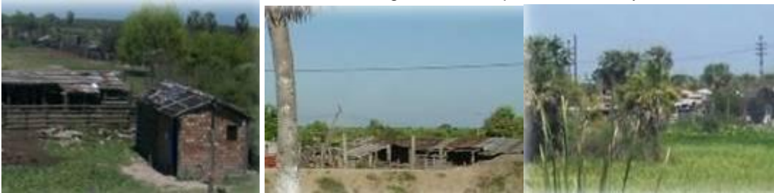
Fig. 10 Informal Settlements in Puerto Vilelas

With much of the population not covering their basic needs and in a context of restriction of land suitable for housing low-income sectors, the city is constantly expanding. Those who have some savings capacity, access solutions provided by the state. Those who have minimal resources make it through informal markets or seek sharing options or occupy empty lots in outlying areas or in areas of environmental risk. Strategies focused only on specific projects at the neighborhood scale, do not promote adequate integration to the city. In this context, the actions and investments of the state are in severe risk diluted in a heterogeneous mosaic of isolated interventions that do not produce significant impacts in the city. Interventions and state projects are enhanced and amplified when they acquire strategic significance. Perhaps one of the most pressing problems of Latin American cities is the problem of the availability of developable land, especially those accessible to lower-income sectors. It is common to hear among municipal planners that much of the urban problems in AMGR arise from the scarcity of land suitable for urbanization. The problem is not the availability of land, but the availability of urbanized land, with basic services and infrastructure to enable integrated development of the city.