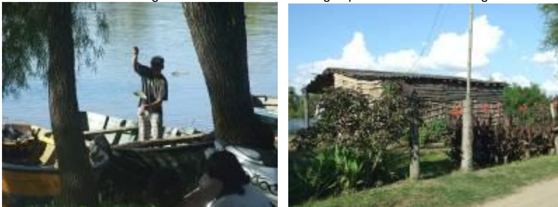
Fig. 12 a) Fishing for subsistence, b) coastal dwellings.

Despite the frequent abuse in the exploitation of natural resources resulting in soil degradation and disruption of natural ecosystems. the regenerative capacity of the natural environment that before cessation of operations, exhaustion or excessive soil erosion. In a relatively short period of time nature is able to regenerate ecosystems recomposing the diversity of animal and plant species. The neighborhood has a high degree of social organization that makes Fishermen's Association one of the engines of initiatives in achieving improvements for the neighborhood.