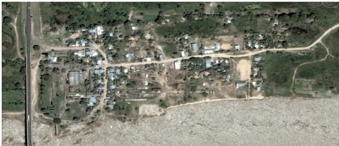
Fig. 3 San Pedro Pescador in 2002

The neighborhood has a privileged location, directly opposite the waterfront of the neighboring city of Corrientes, capital of the province of the same name. Although administratively belonging to the municipality of Colonia Benitez, it has stronger ties with the most populated centers of the Metropolitan region, considering it is 12 km from Resistencia, 6 km from Barranqueras, and only 1,6 km from Corrientes. A large proportion of inhabitants of San Pedro takes advantage of services and facilities from the neighboring Corrientes. This privileged setting means they can offer their products to thousands of potential customers who daily cross the bridge in both directions. But this same situation puts them in a position of vulnerability due to flooding from the Paraná River.