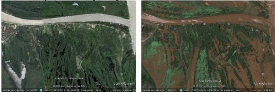
Fig. 11 a) Barrio Tres Bocas in 2002, b) Barrio Tres Bocas in 2010,

The population of the district is estimated at around 80 families, about 500 people with great portion of children and young people, related mainly to fishing activities and making occasional informal jobs. The houses are mostly poorly constructed with extensive use of palm tree "carandá", iron sheets and adobe walls. Elevated pole structures are frequent to reduce the hardship in case of flooding while creating shaded spaces on the ground level. Most homes have verandas and open areas for vegetable gardens and small livestock.